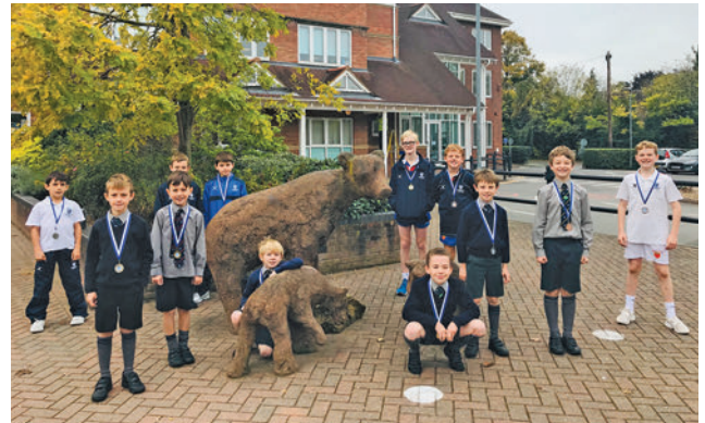
Pictured above are the year group medal winners.

After such a successful first event, we look forward to making this an annual fixture in the calendar.