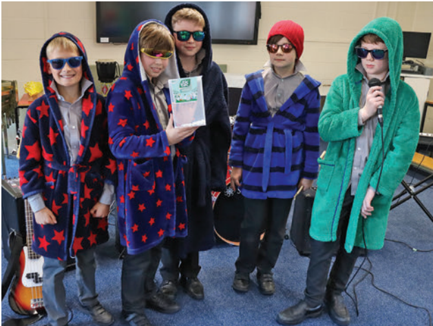
Boys work in their groups and do all of the writing, music and production themselves.