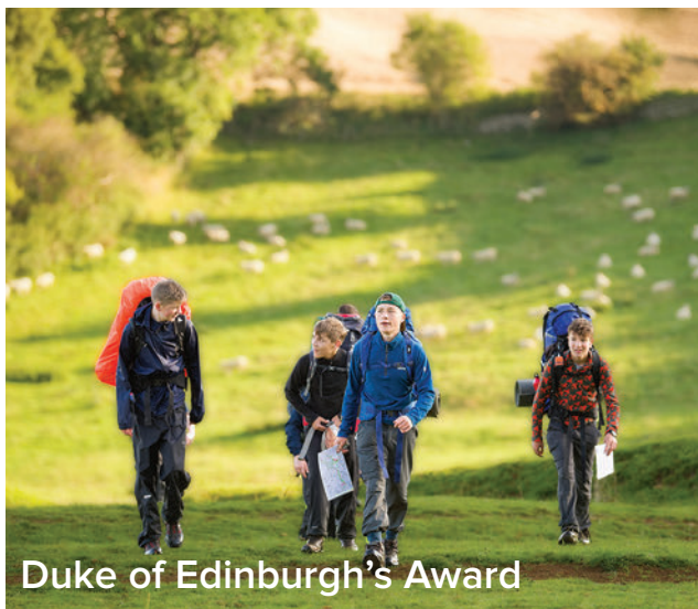
Boys undertaking a Duke of Edinburgh's Award Bronze expedition, approaching Lynes Barn, near Hailes, Gloucestershire